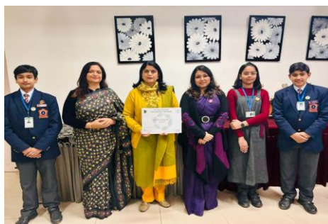
GREEN SCHOOL AWARD-2023