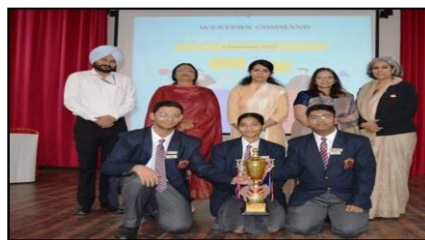
2 ND IN WESTERN COMD ENGLISH DEBATE 2023