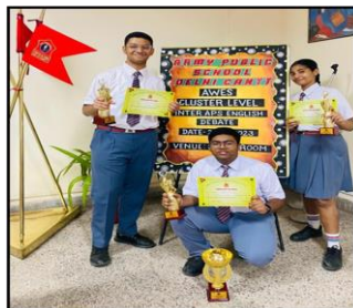
1st IN DELHI AREA CLUSTER LEVEL ENGLISH DEBATE 2023