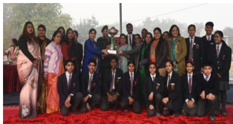
BEST HOUSE(LAXMIBAI) IN CO CURRICULAR ACTIVITIES 2023-24