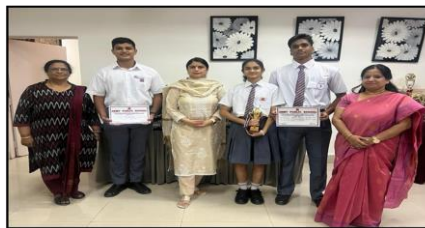
2 ND IN DELHI AREA CLUSTER LEVEL HINDI DEBATE 2023