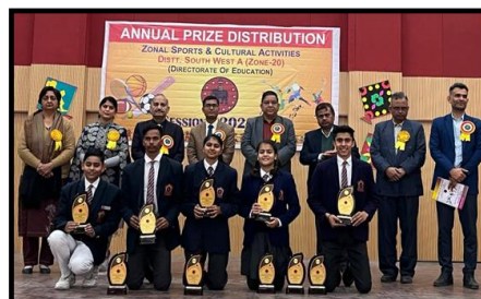
ZONAL TROPHY FOR THE SIXTH CONSECUTIVE YEAR