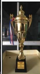
PROUD WINNERS OF DELHI STATE PRE-SUBROTO CUP FOOTBALL