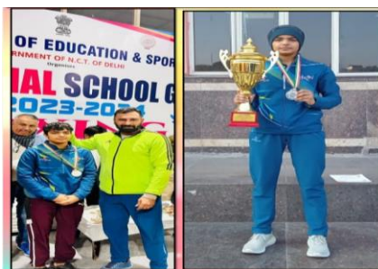
PROUD WINNER OF NATIONAL BOXING CHAMPIONSHIP (SGFI)