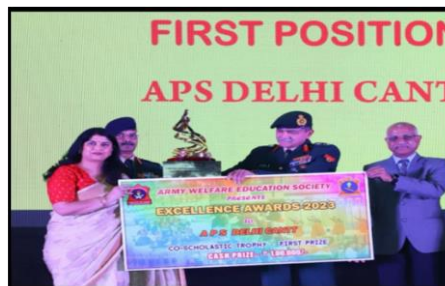
AWES ALL INDIA CO- SCHOLASTIC TROPHY - 2023